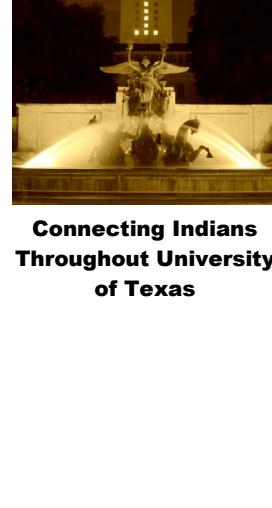
Connecting Indians Throughout University of Texas